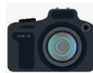
Photo update: IPC has informed us that they are experiencing delays in sending photos out. If you have not yet received your order, please reach out to the contact below. Please note: you will