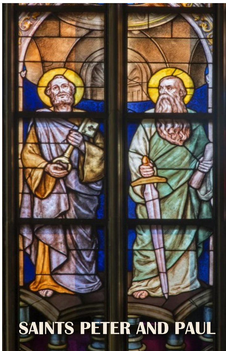
SAINTS PETER AND PAUL

***Emergency due to death or serious illness, press 9.